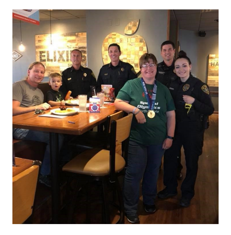
Applebee's Neighborhood Grill and Bars once again partnered with the Law Enforcement Torch Run and sponsored the Tip-A-Cop on Sept. 18-19! More than 60 law enforcement personnel from 17 different agencies volunteered their time, hosting guests in Applebee's across the state to raise awareness and tip money for Special Olympics.