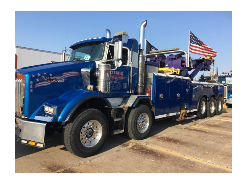
Special Olympics North Dakota and Law Enforcement Torch Run hosted the 2018 Truck Convoy for Special Olympics on Saturday, September 8<sup>th</sup>. A highlight of the event was the live auction where drivers bid in for the right to be the Lead Dog and Tail End positions of the Truck Convoy!